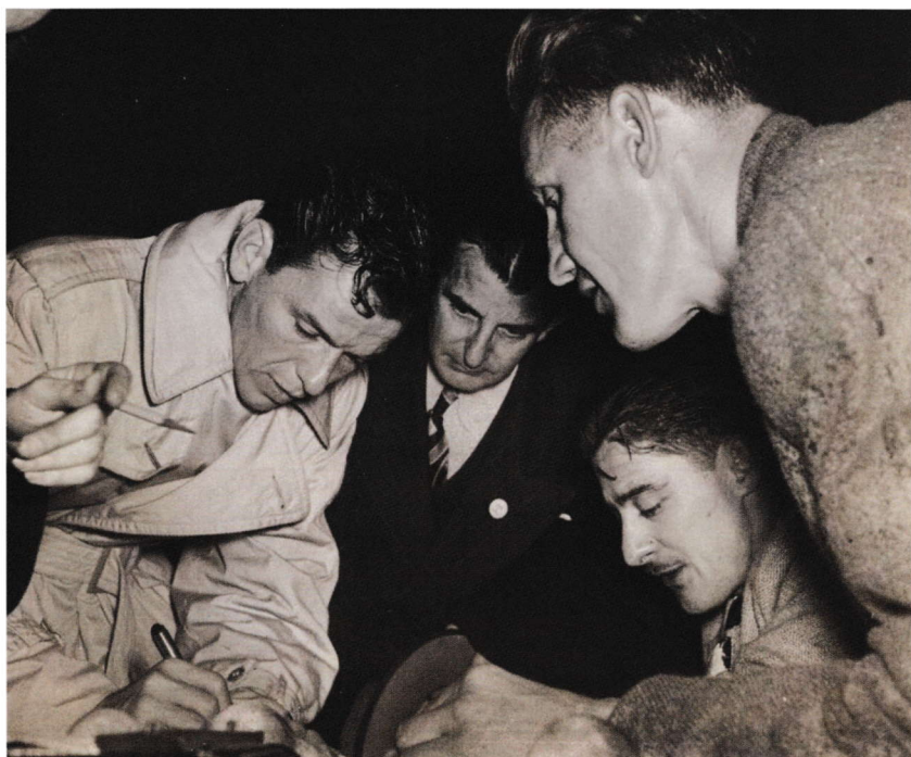
Frank Sinatra and fans at Hoboken City Hall, 1947

For more information, please call the Hofstra Cultural Center at 516-463-5669 or visit hofstra.edu/culture .