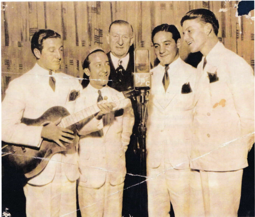
The Hoboken Four at a Major Bowes Amateur Hour radio broadcast, 1935 From the Collection of the Hoboken Historical Museum

The Helene Fortunoff Theater, Monroe Lecture Center, California Avenue, South Campus